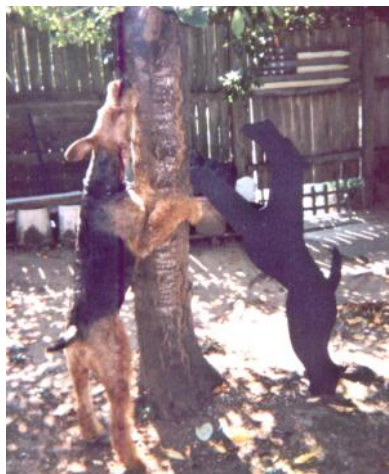
Hi, How are things in YOUR back yard?

Airedale kisses to all, from Raleigh Seybert—PA