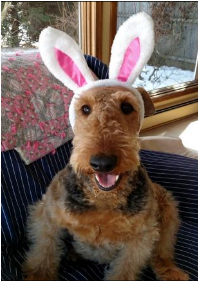
Nellie Belle Forbush, ready for Easter