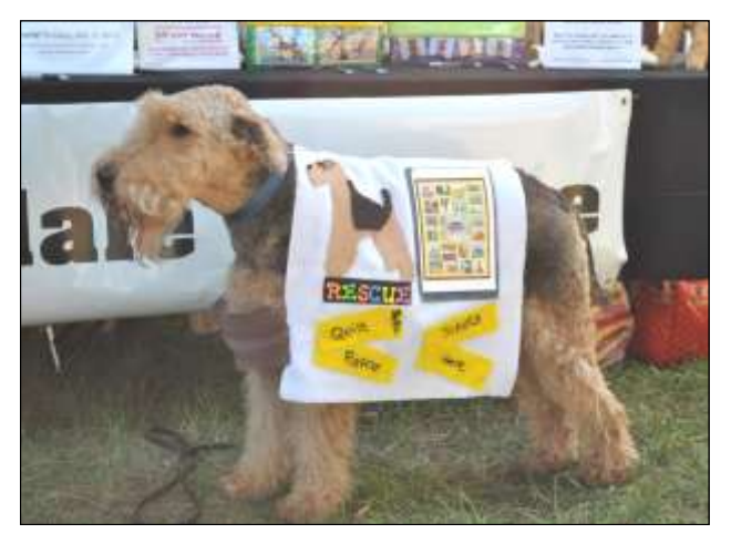
Saxon, the walking billboard

It was a very successful day of sales for rescue and also the quilt. After the Devon show closed, Lori