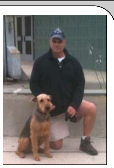
Riley at School

Riley was a huge hit, they all took well to him, and he seemed to take a special interest in the amputee. After sniffing around the new place, he was patient with all who wanted to get a close look