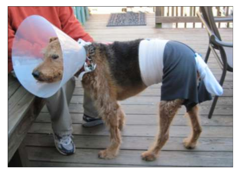
Duffy in Full Regalia

Our dog sitter has described Duffy as an "enterprising culprit." Can't argue with that.