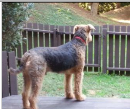
Pharoh Brown, on squirrel watch!

Just to let you know Daisy Mae had a great time at Barn Hunt this past Sunday, she made it through the tunnel the first try. But unfortunately she did not find the rat on the first try.