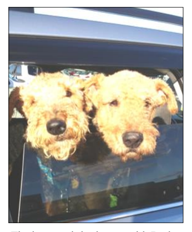
The boys wait in the car with Dad while Mom runs errands.